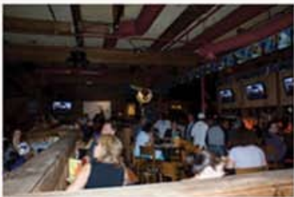
Slideshow: BullsEye Bar at Black Angus Photos

On September 8, 2011, the BullsEye Bar was a positively buzzing with guests watching the Saints vs. Packers game and partaking in the game time food and drink specials. The concept is a casual sport bar, bringing back memories of the sports bar days in the mid-1990s. You'll have a great view from anywhere in the bar of any of the 10 Hi-Def flat screen TVs that line its walls. The Saints vs. Packers game was on and the folks were cheering away as their favorite teams scored touchdowns. There is free wi-fi in the bar too. This is the 29th and final BullsEye Bar that has been retrofitted into existing Black Angus locations. The first opened September 2009 in Black Angus Burbank. The bar has its own special menu, but you are free to order from the full Black Angus menu if you wish. The Bud girls were handing out Bud Light beaded necklaces, giving the bar a "Mardi Gras" atmosphere. Go Saints! AM 570 KLAC with host, Vic "The Brick" Jacobs, was giving away prizes ranging from LA County Fair tickets to Dodger game tickets. Black Angus CEO, Merry Taylor, and General Manager, Mike Tefft, were also on hand for the festivities.